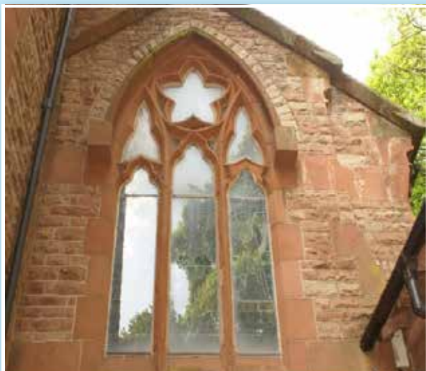
Lady Altar window showing damage to tracery with potential loss of stained glass. Similar problems at the Sacred Heart Altar and rose window on south Transept

Raising the money to repair the church is a formidable task but with your goodwill and generosity we can certainly get those urgent and essential repairs underway.